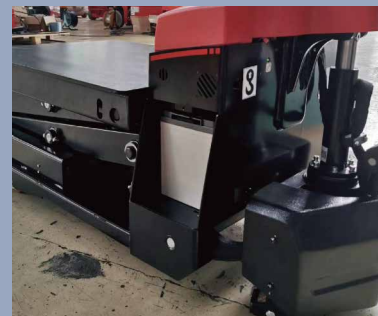
The batteries can be removed conveniently, for easier maintenance and disassembly