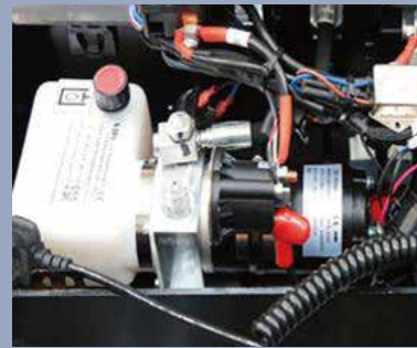
Integrated hydraulic unit, compact structure, less space