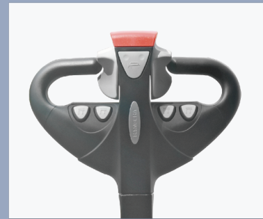
Multi-function handle, reliable, beautiful and simple, all functions can be completed with one hand.