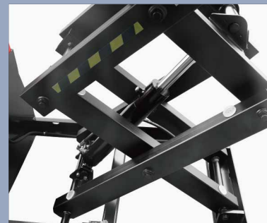
Double scissors structure, rectangular tube profile, more stable and stronger